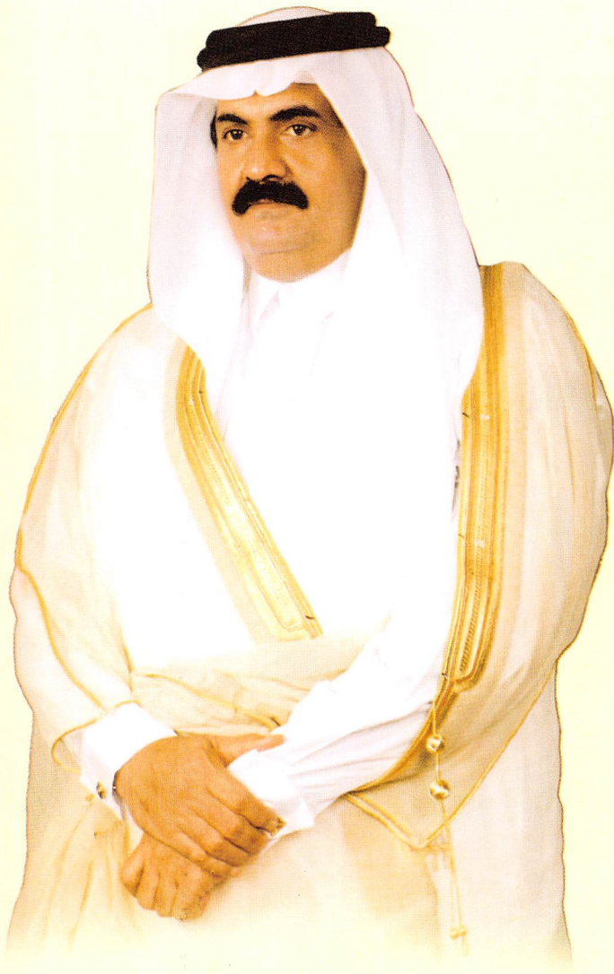
His Highness Sheikh Hamad Bin Khalifa Al-Thani Emir of the State of Qatar